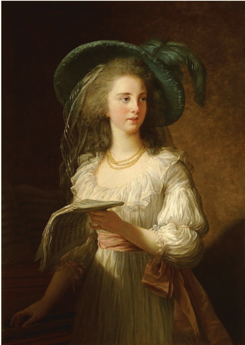
Portrait of Gabrielle de Polastron (Martine-Gabrielle-Yoland de Polastron (1745–1793), Duchesse de Polignac.), Élisabeth Louise Vigée Le Brun

And we find a great painting by the woman artist Élisabeth Le Brun: